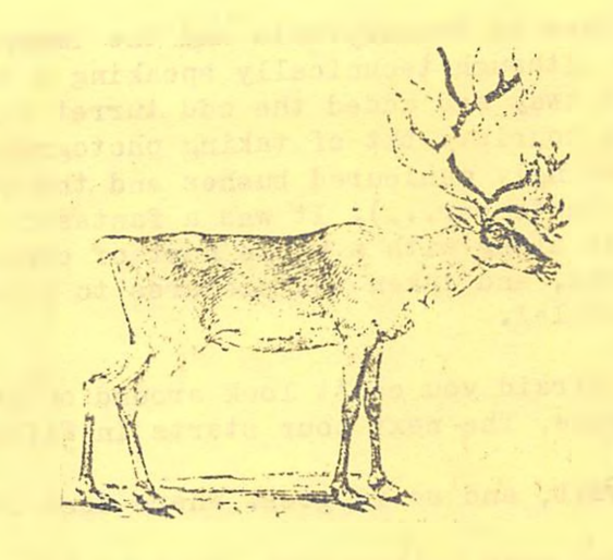
Artists Impression Of The Irish Red Deer.